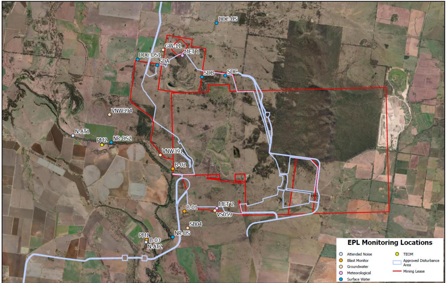
Figure 1 – EPL 21283 Monitoring Locations