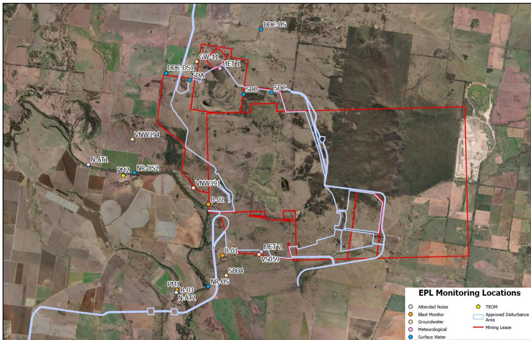
Figure 1 – EPL 21283 Monitoring Locations