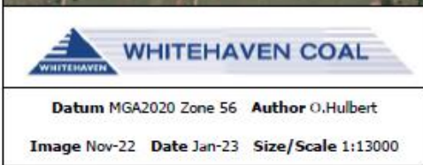
Figure 1 Gunnedah CHPP EPL3637 Monitoring Locations