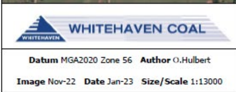
Figure 1 Gunnedah CHPP EPL3637 Monitoring Locations