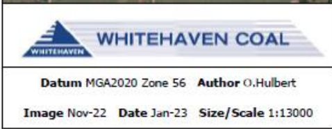
Figure 1 Gunnedah CHPP EPL3637 Monitoring Locations