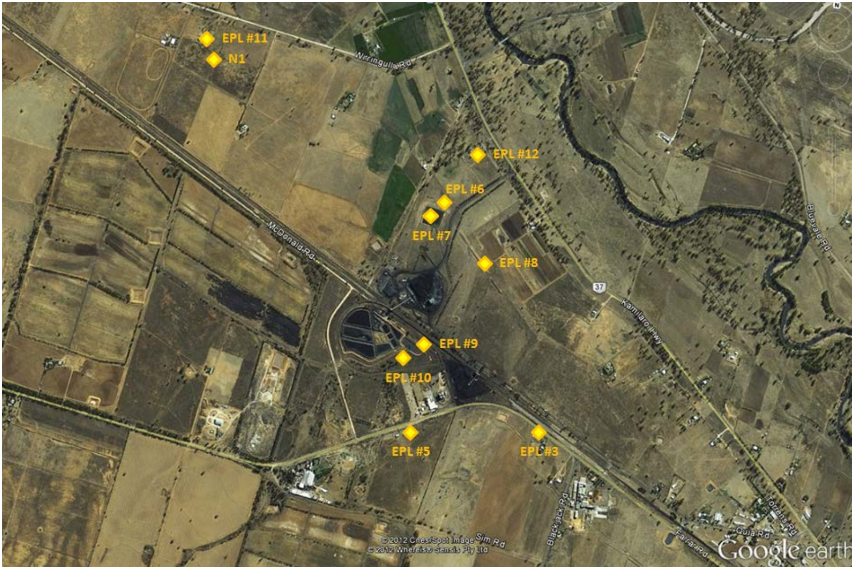
Figure 1 – EPL 3637 Monitoring Locations